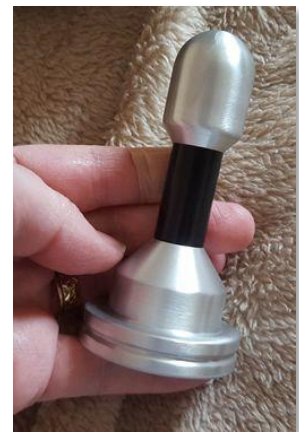
Figure 18 - The Flange bipolar electrode