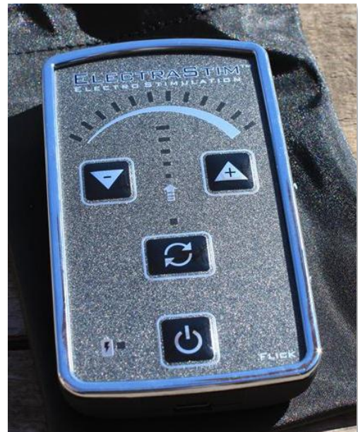
Figure 8 - The EM60 Flick entry level control box from Electrastim

Control boxes are available for all budgets with the more expensive ones having some fantastic features such as upgradeability and being able to be controlled from afar over the internet.