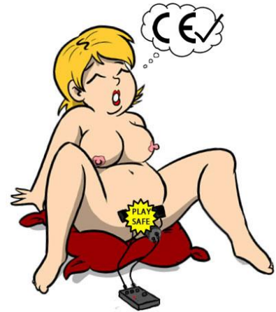
Figure 3 - Always use safe equipment when you play

Each plug flicks from positive to negative multiple times each second.