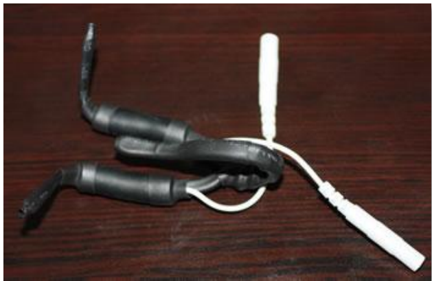
Figure 17 - My DIY Clitrode was a lot of fun to make but using it is much more enjoyable

I enjoy using bipolar electrodes so much due to their simplicity and the way I can quickly wire myself up for some fun. I love coming up with new idea for them.