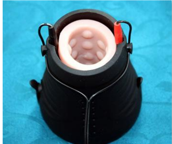
Figure 16 - The Jack Socket is a very popular e-stim male masturbation sleeve

There are a huge number of different ones available and I have only just barely touched on the different designs. Have fun with them and if you want to make your own then that can be very rewarding.