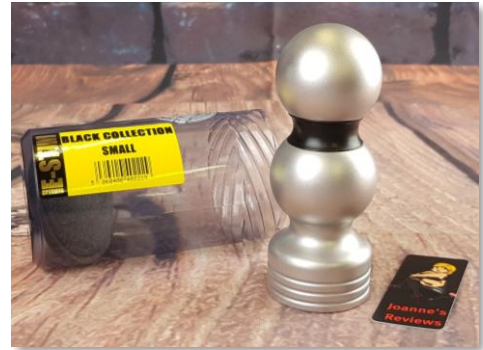
Figure 4 - A commercially available electrode from the Black Collection made from aluminium by E-Stim Systems