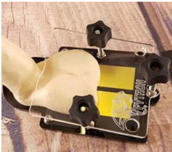
Figure 15 - The Python Compression System Bipolar Electrode

Bipolar electrodes are not just for internal stimulation though, there are a wealth of different designs available to try.