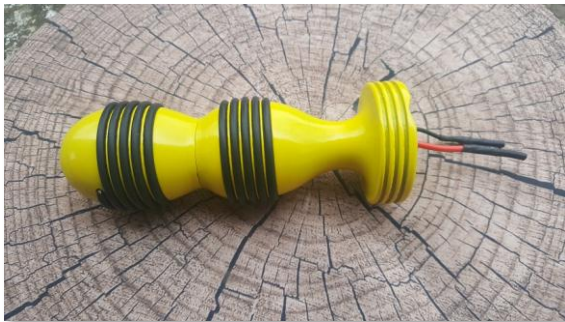
Figure 5 - Conductive rubber on one of my home made insertable electrodes

Galvanized steel and other metals should also not be considered safe for stimulating.