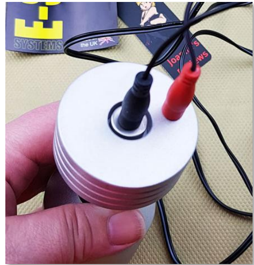
Figure 14 - Two plugs from the same cable/channel plugged into a bipolar electrode

Bipolar electrodes can be combined with other electrodes by just using one of the sockets in them to target specific internal areas such as the g-spot or prostate.