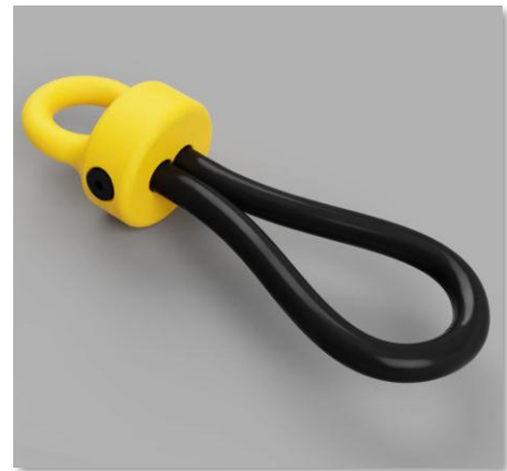
Figure 12 - My DIY Didi monopole electrode that I make and sell

Your imagination is the only limit to how you use conductive rubber, and I have had a lot of fun using it in my DIY electrodes. Conductive Rubber does break down over time, eventually needing to be replaced, unlike metal electrodes.