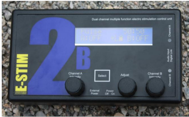
Figure 9 - An advanced e-stim control box, the 2B from E-Stim Systems

Often made for play boxes will have multiple routines in them that provide vastly different feelings, and it is fun to experiment with them.