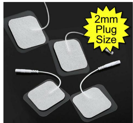
Figure 10 - Self-adhesive monopole electrodes are incredibly versatile

You can also gently wash the sticky face to get rid of dead skin cells, allowing it to dry before placing it back on its plastic backing. This can be done several times to extend their life.