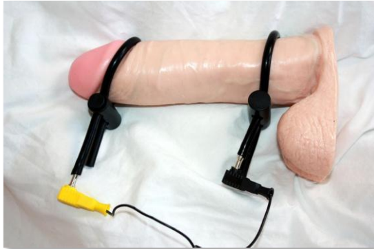
Figure 11 - Two conductive rubber cock loops around a penis

I suggest shaving the area where they are going to be used to help get a good electrical contact and as it helps when you peel it off after your e-stim session.