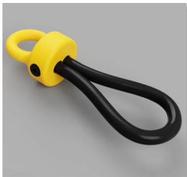
Figure 2 - My Didi Monopole Electrode

The busiest section of my site is most definitely the E-Stim Category 1 where I host all sorts of useful files and information together with guides.