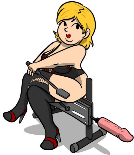
Figure 1 - Joanne, yes, it's a pretty good likeness.